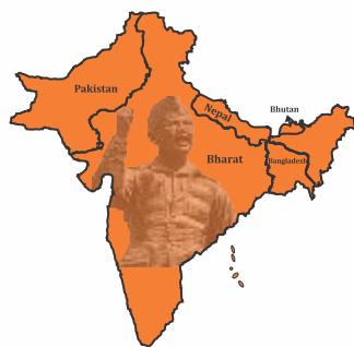
SAU - BHA - GYA SAMYUKTA BHARAT GANRAJYA (Having Bharat - Pakistan - Bangladesh - Nepal - Bhutan - each as Autonomous State)