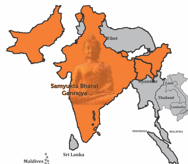
SAFON SOUTH ASIA FEDERATION OF NATIONS (Having Samyukta Bharat Ganrajya - Tibet - Myanmar - Laos - Thailand - Cambodia - Vietnam - Malaysia - Indonesia - Sri Lanka - Maldives each as Autonomous Nation)